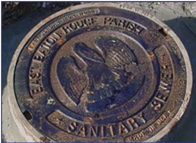
One of the first steps in rehabilitation includes a physical inspection of manholes and pipes to identify blockages.

Rehabilitation of the sewer collection system is a comprehensive physical process that begins with cleaning and inspection of sewer pipes and manholes. Typical rehabilitation repairs include pipe and manhole replacement and trenchless technologies that minimize above ground disturbances, such as cured-in-place pipe liners.