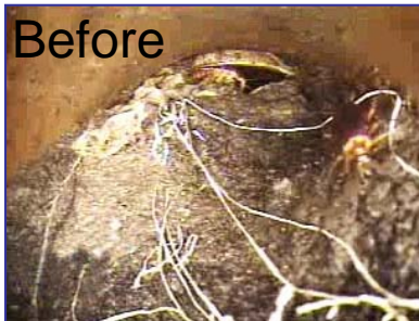
Simply cleaning the pipes and manholes in preparation for the physical inspection removes blockages, debris, and roots.